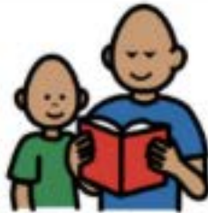
read a story