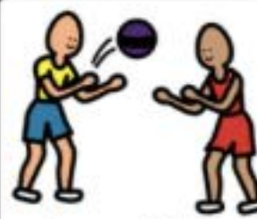
play with ball